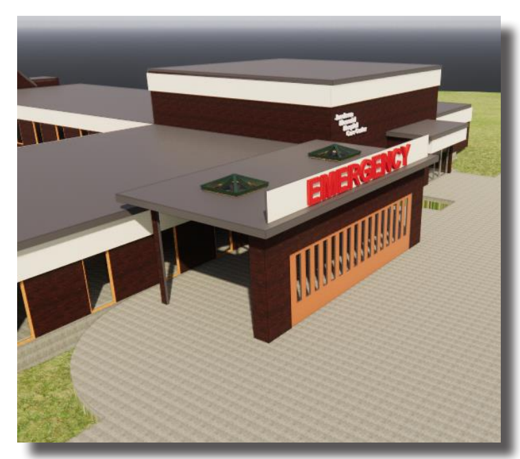
This graphic is a rough conceptualization of the emergency entrance which would be attached to the front of JMHCC.

Those who do not wish to participate in Giving Hearts Day, but who want to donate to this vital project, are wel-