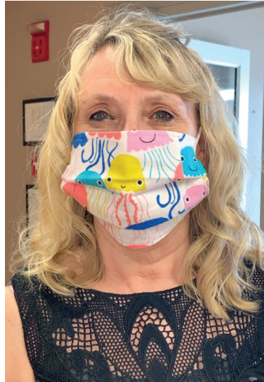
A visitor dons one of the face masks which was donated to JMHCC and its clinics for patients and visitors to use.

"We've stayed home because of health reasons and sometimes you get kind of bored, so it gave me something